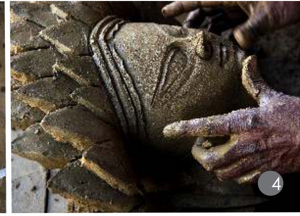
4. The mask is again covered with clay.