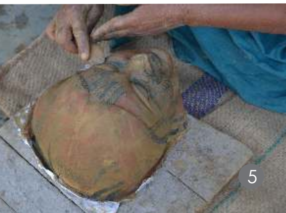
5. It is then layered with pieces of soft fabric.