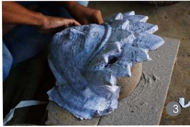
3. Layers of moist paper are pasted on the powdered mask.