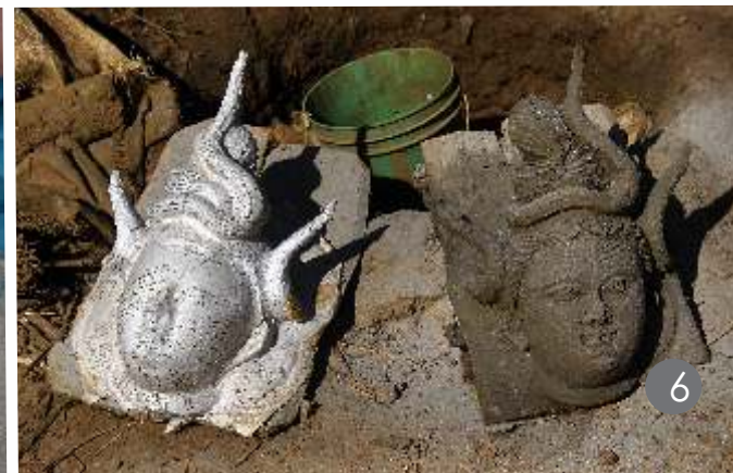
6. The initial layer of clay is removed.