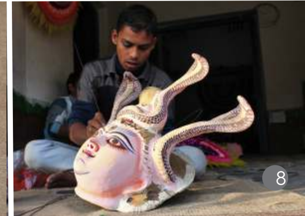
8. The mask is coloured and decorated with embellishments.