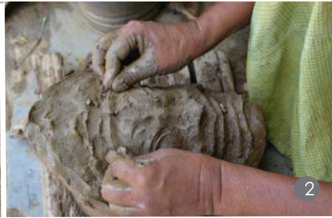
2. Clay model of a mask is dried in direct sunlight and covered with powdered ash.