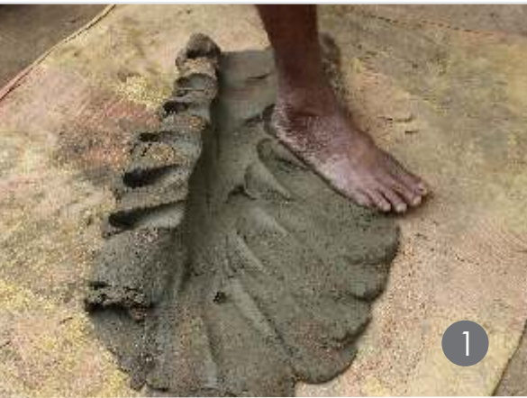
1. The clay is kneaded.