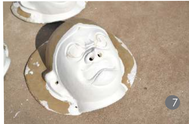
7. A coat of white paint is applied.